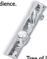
Tree of Life Mezuzah